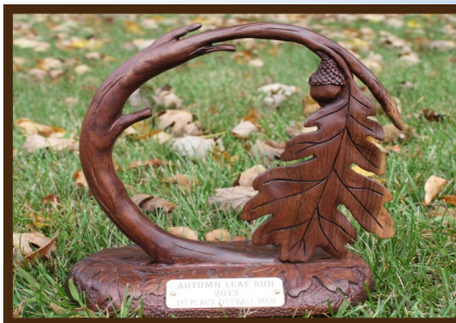
Annual Hand Carved Trophy Overall Mens/Womens Winner

T-shirts will be guaranteed to each pre-registered participant on race day along with goody bags and post race hospitality.